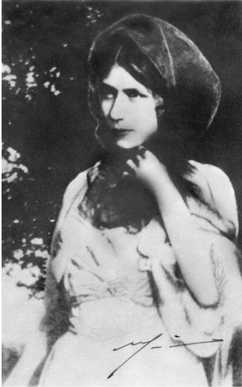
The Mother in Algeria, 1906-1907